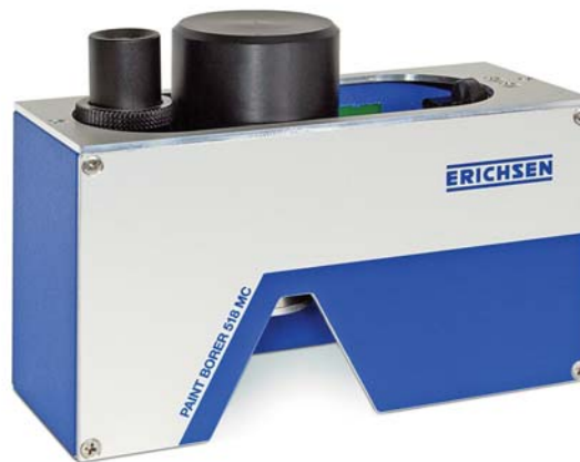
PAINT BORER 518 MC

Thickness measurements in accordance with the standardised wedge cut method