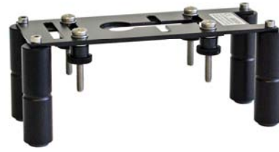
PAINT BORER 518 MC with specimen platform