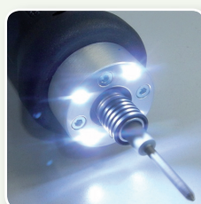
PLUTO with LED, see page PLUTO..TA