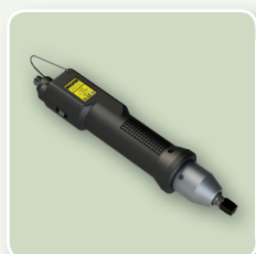
PLUTO IN PUSH-TO-START

Kolver's ingenuity and experience have led to the development of Pluto (PLUs Torque) screwdrivers, the most advanced DC tools in the market, able to reach 50 Nm. They feature an innovative coreless electric motor with low inertia and friction with absence of iron losses for extreme efficiency and extended life. Planetary gearboxes with high quality composite materials. Pistol grip to fit operator's hand ergonomically. PLUTO screwdrivers are available in pistol or inline styles; lever, trigger, or push-to-start. All models are ESD safe. Pluto CA/SR series drivers are designed for higher torque applications up to 50 Nm. The CA/SR features a sleek design with a robust aluminium body allowing for operator comfort and durability. Torque & Angle models are also available.