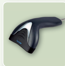
BAR CODE SCANNER code 020050