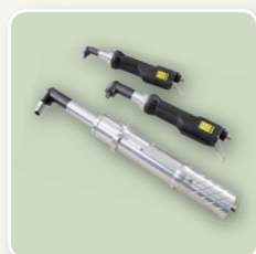
ANGLE SCREWDRIVERS see page 16