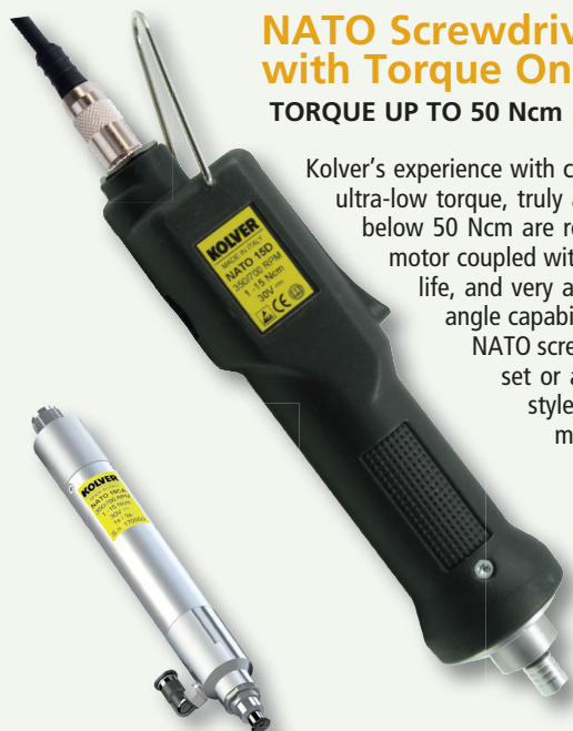
NATO for automation with suction head (optional)

Kolver's experience with current control technology has led to the creation of the NATO screwdrivers; the first ultra-low torque, truly accurate current controlled torque driver designed for applications in which torques below 50 Ncm are required, especially in the mobile industry. The NATO features an innovative electric motor coupled with planetary gearboxes, producing extremely low inertia and minimal friction for long life, and very accurate torque production. NATO Series is available with torque only or torque and angle capabilities.