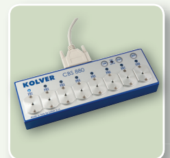
SOCKET TRAY CBS880 code 020042