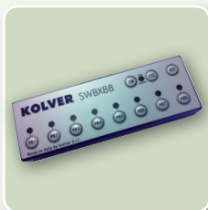
SWITCHBOX SWBX88 code 020033