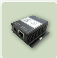
ETHERNET DEVICE code 020075

range. All units comply to norms 61000-6-2 and 61000-6-3 and therefore have better endurance in environments with high noise and interference levels. Improved EMC features are guaranteed thanks to solid steel base and back panel. The new features allow users to select a fast approach speed and a final tightening speed to adapt to any type of application and it is also possible to select an endless time of clockwise rotation for any application requiring no max time option. The new EDU2AE control units are now multilanguage: you can choose among English, Italian, German, French, Portuguese or Spanish. A wide range of accessories for remote programming and PC interface is available for the complete EDU2AE series.